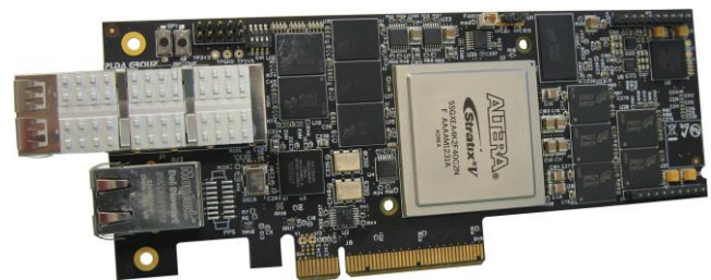
ReFLEX XpressGX5-LP HE