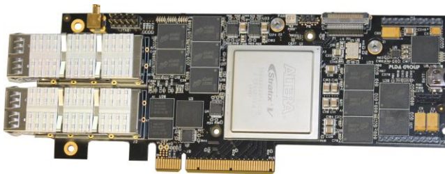
ReFLEX XpressGX5-LP QE