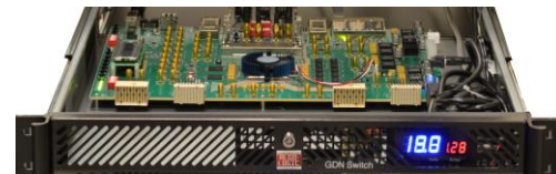
GDN Switch-100 on Altera 100G Stratix® V GX Board